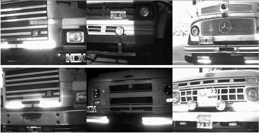
Fig. 1. Non deteriorated truck image samples in the first row. Second row shows three examples of deteriorated truck images: noisy, incomplete and broken characters.

morphological operations, edge detection [10], hierarchical representations [4], image transformations [7], etc. There are also detection algorithms based on AdaBoost [8] and support vector machine (SVM) [9] classifiers, using Haar-like features or the color and texture information.