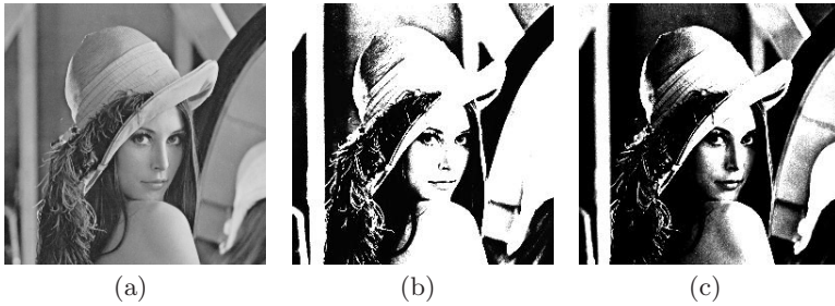
Fig. 3. Leena image (a), (b) and (c)

Comparing the images of figs 2 and 3, one can observe the efficiency of the proposed method in enhancing the images.