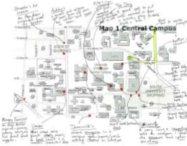
Fig. 1. Participants annotated paper maps with information they wanted to share with their peers