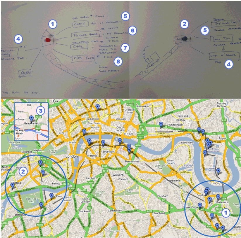
Fig. 2. Upper half: An example of a participant's sketch about his regular routes. Lower half: the related location tracking data. The markers represent approximate search locations. Multiple queries from one location are presented as one marker: (1) home area, (2) work area, (3) weekend holiday out of town, (4) pubs, (5) curry restaurant, (6) picture house cinema, (7) cafe, (8) supermarket. The dashed lines connecting areas (1) and (2) are the participant's daily train route.