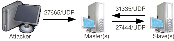
Fig. 3. Ports and protocols used by Trinoo