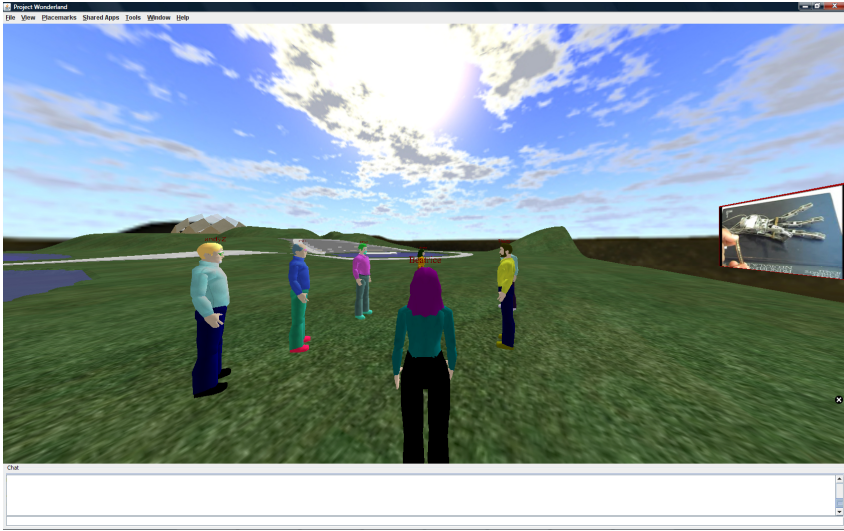
Fig. 1. Snapshot of the “UniWorld” environment. A group of students discussing an instructional video on robotics displayed on a screen in “UniWorld” - the 3D CVE that will be used in “The ShanghAI Lectures”. The screen shot is taken from a pilot study with a prototype of the virtual world.

Behavioral tracking offers the opportunity to collect longitudinal data of in-world behavior in an unobtrusive way [12]. Although the advantages of tracking methods have been recognized by virtual world researchers, behavioral tracking is typically difficult to realize as commercial providers of virtual environments do not allow direct access to their databases [12, 13]. Therefore, observational studies of in-world behavior have mostly used screen recorders, which provide qualitative data that are time consuming to analyze [3]. However, recorded team interactions using Project Wonderland's built-in movie recorder provide valuable qualitative information in addition to the quantitative behavioral tracking data. Audio and chat communication data as well as work artifacts (e.g., shared work documents) are stored and can be used for quantitative and qualitative analysis of content.