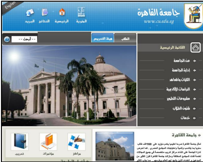
Fig. 1. Egypt: Cairo University, http://www.cu.edu.eg

The following examples show Arabic Websites and comment on the culture factors that seem to have influenced their design. Following the discussion of individual sites, comparisons of the sites elaborate on similarities and differences.