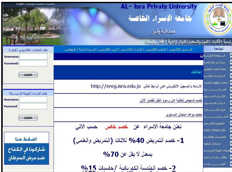
Fig. 4. Jordan: Al Isra University: http://www.Isra.edu.jo

The site could be classified as a long-term time-orientation Website, because it maintains its relation with students who have graduated. In addition, the site allows users to deliver their questions and opinions through E-mail in different ways. This feature emphasizes the Website as more interactive. The Web served the individualism for both students and other users, and it could be considered as a task-oriented Website.