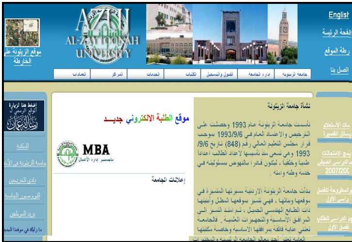
Fig. 2. Jordan: Al-Zaytoonah University, http://www.alzaytoonah.edu.jo

Many links and menus can found in this Website. The orientation of the site towards tasks and roles may reveal a masculine Website. Full information, easy navigation, and easy access to information all help to clarify the user’s understanding of the site and provide a strong incentive to remain at the Website.