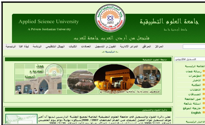
Fig. 3. Jordan: Applied Science University: http://aspu.edu.jo