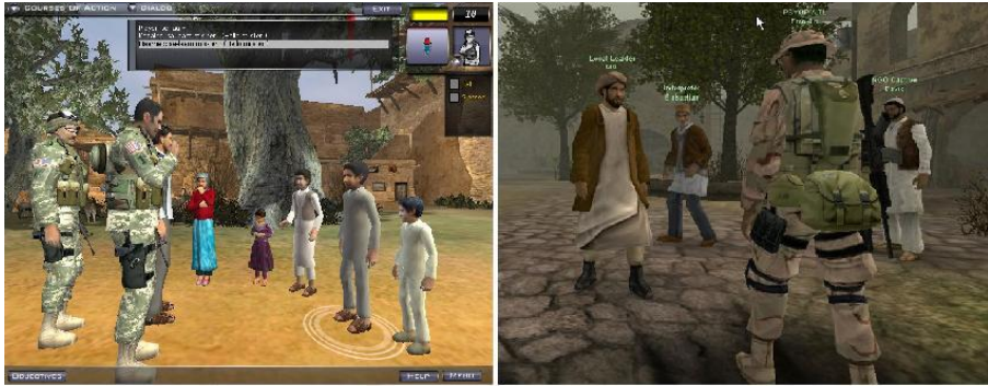
Fig. 2. (Left) The Tactical Language and Culture Training System (Tactical Dari) by Alelo, Inc. [10] and (right) the Adaptive Thinking and Leadership simulation [14]. Reproduced with permission.

In multi-player environments, like the ATL system, inhabitants are human role-players. This can be costly and sometimes challenging to control from an educator’s point of view. Research on virtual humans provides an alternative or supplement to cultural team-training in immersive learning environments. Virtual humans combine artificial intelligence (AI) research in cultural and emotional modeling, speech processing, dialogue management, natural language understanding, and gesturing, among others, to enable natural feeling communication and interaction with computer-controlled characters that listen and respond to the user. Virtual humans are driven by detailed models of tasks, emotion, body language, and communication [16]. The underlying representations readily support explanation, which can be useful for learning [7]. In the case of intercultural education, it is important to endow virtual humans with the ability to explain their actions and reactions in terms of their cultural worldview. It is also important that their behavior be controllable in order to establish conditions that best promote learning.