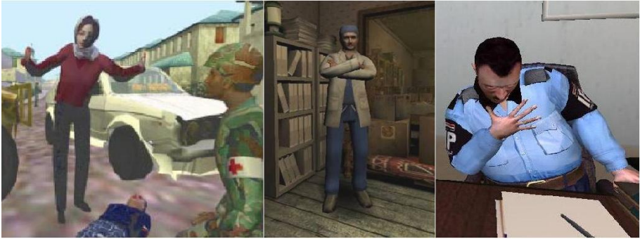
Fig. 3. Expressions of anger, skepticism, and appreciation by virtual humans [7,16]

In a face-to-face intercultural situation, there are several ways that intelligent interventions could promote learning: