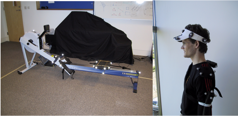
Fig. 1. Ergometer and rower augmented with VICON markers. The erg, its seat and its handle were 3 objects. Parts of the body were captured for future use.

The VICON motion capture system [11] was used with 10 cameras and default parameter values to track the position of single points on multiple objects augmented with 3 or more retro-reflective markers (see Fig. 1). The sample rate was set to 200Hz. The objects are automatically identified using unique markers topologies.