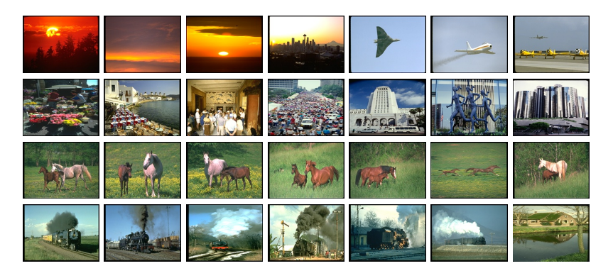
Fig. 5. Retrieval results using JEC on Corel5K. Each row displays the first seven images retrieved for a query. From top to bottom, the queries are: sky, street, mare, train .

It should be noted that most top-performing methods in literature rely on instance-based representations (such as MBRM, CRM, InfNet, and NPDE) which are closely related to our baseline approach. While generative parametric models such as CorrLDA [4] have significant modeling appeal due to the interpretability of the learned models, they fail to stack up to the nonparametric representations on this difficult task. Table 1 confirms that the gap between the two paradigms remains large.