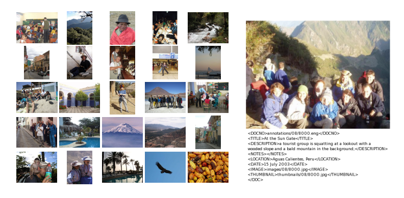
Fig. 2. Sample IAPR data. On the left are 25 randomly selected images from the dataset. On the right is a single image and its associated annotation. Noun extraction from the caption provides keywords for annotation.

For the IAPR TC-12 and ESP datasets, we have made public the dictionaries, as well as the training and testing image set partitions, used in our evaluations<sup>5</sup>. On all three