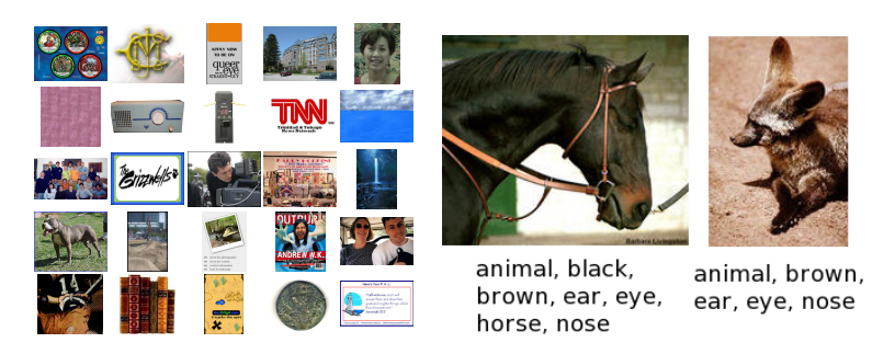
Fig. 3. Sample ESP data. On the left are 25 randomly selected images from the dataset, while on the right are two images and their associated keywords. These images are quite different in appearance and content, but share many of the same keywords.

annotation datasets, we evaluated the performance of a number of baseline methods. For comparisons on Corel5K, we summarized published results of several approaches, including the most popular topic model (i.e. CorrLDA [4]), as well as MBRM [9] and SML [2], which have shown state-of-the-art performance on Corel5K. On the IAPR TC-12 and ESP datasets, where no published results of annotation methods are available, we compared the performance of our baseline methods against MBRM [9] which was relatively easier to implement and had comparable performance to SML [2]<sup>6</sup>.