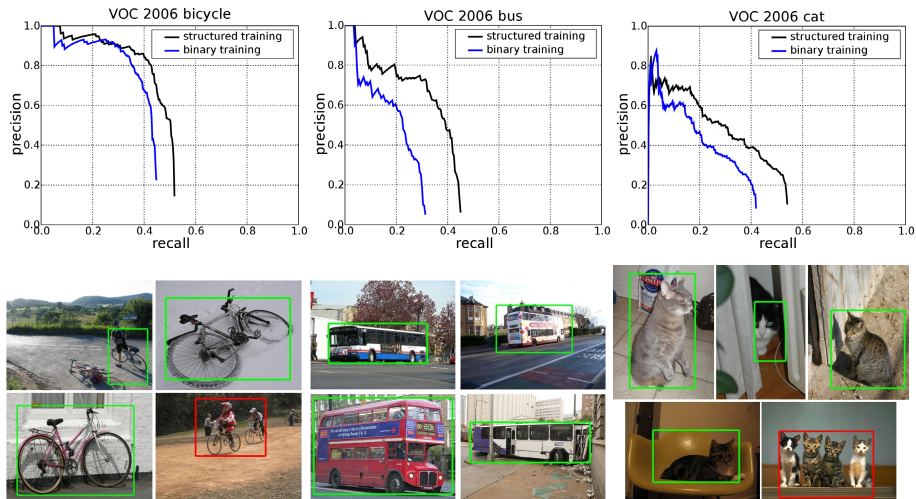
Fig. 5. Precision–recall curves and example detections for the PASCAL VOC bicycle , bus and cat category (from left to right). Structured training improves both, precision and recall. Red boxes are counted as mistakes by the VOC evaluation routine, because they are too large or contain more than one object.

Object Categorization in 2006. The dataset contains ground truth in the form of bounding boxes that were generated manually. Since the images contain natural scenes, many contain more than one object class or several instances of the same class. Evaluation is performed based on precision-recall curves for which the system returns a set of candidate boxes and confidence scores for every object category. Detected boxes are counted as correct if their area overlap with a ground truth box exceeds 50% [17].