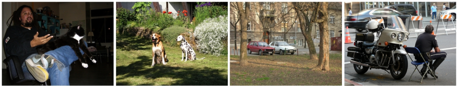
Fig. 2. Example images from the PASCAL VOC 2006 dataset. Images can contain multiple object classes and multiple instances per class.