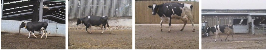
Fig. 1. Example images from the TU Darmstadt cow dataset. There is always exactly one cow in every image, but backgrounds vary.

For evaluation we performed experiments on two publicly available computer vision datasets for object localization: TU Darmstadt cows and PASCAL VOC 2006 (Figures 1 and 2).