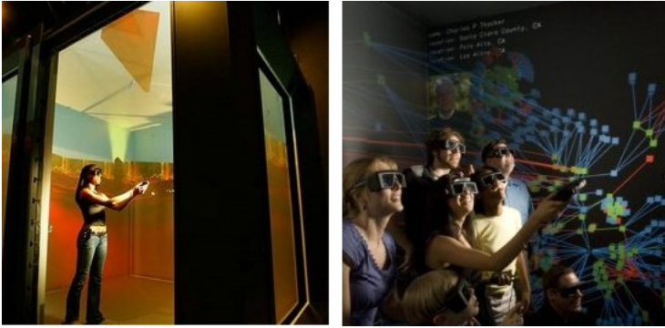
Fig. 1. DiVE: Left - Person in DiVE, Right - Exploring Social Networks in the DiVE

(properties) are rendered, and which nodes and edges are considered meta-data that is shown only as “details on demand” when a user “touches” the node. When the user touches the node, data associated with the node is presented to the user. Whatever schema is available can be retrieved, and the XML Schema data type provides the information needed to format the data in a human-readable form and provides captions for the data as well. The network visualization and extrusion technique is implemented in the Syzygy virtual reality library [27]. GraphViz [15] or Boost (only available on Linux) can both be used for the initial 2-D network layout. Vis3D is used to save and load visualizations. Pictures showing Redgraph in action are shown rightmost in Figure 1 and a movie may be viewed on the Web at http://www.redgraph.org .