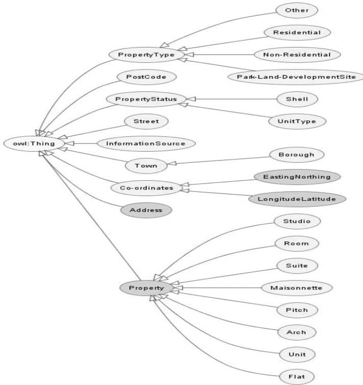
Fig. 1. Ontology for the Camden Land and Property Gazetteer