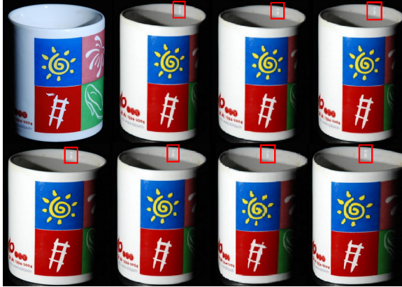
Fig. 2. Novel View Results. The left above image is the reference image and the left below image is the generated new source image. The other images are the synthesized novel view images that we specify the camera move around the Z-axis of the target from left to right.