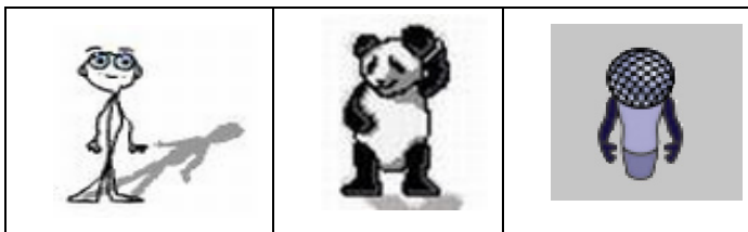
Fig. 2. Adult, child and microphone characters

Similar to reading with a parent or teacher, the companion character provides support by modeling words (i.e. reading to the student), highlighting the text to be read, and giving both encouragement and immediate feedback. We use a panda character while the adults now interact with a stick-like figure (see Figure 2). Initial software trials used a character for adults shaped like a microphone who 'spoke' even though it did not have a mouth and it said things like "Click on my picture to start reading". It also 'listened' even though it had no ears, and thus suffered from a credibility problem. We observed that the majority of our adult immigrant users would click on all pictures in the book in response to the instruction "click on my picture", without realizing that the microphone was talking about itself! The switch to a character which was more suggestive of human characteristics (such as ears and a mouth) alleviated all traces of this confusion.