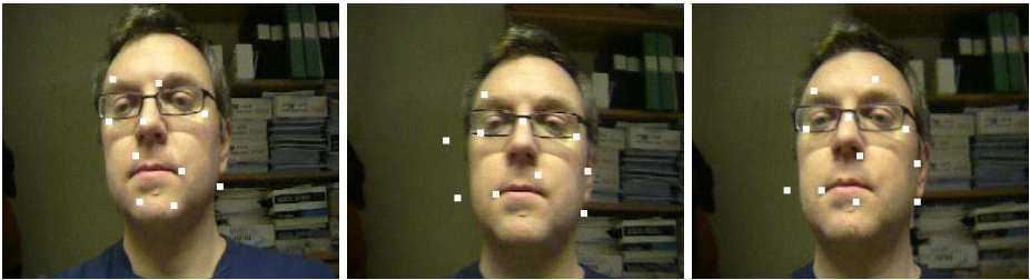
Fig. 1. Three out of 100 frames used for testing. Detected feature points are shown as white squares.

After local optimisation the description length lowered to 9 575 bits for a model with 12 model points. Here 740 of the 880 points were associated to a model point. In Figure 2 is shown three frames out of the 100 overlaid with feature points and best fit of the 12 model points obtained after minimising description length. Notice that certain points in Figure 1 are classified as outliers and are not shown in Figure 2.