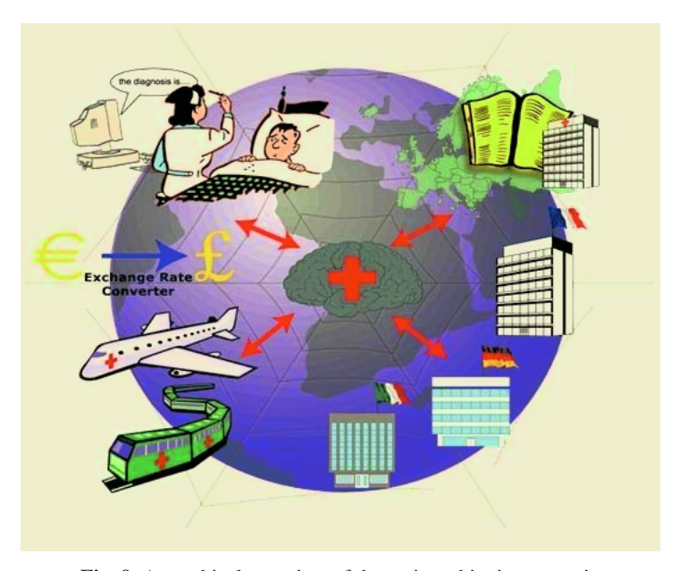
Fig. 9. A graphical overview of the patient shipping scenario

Task and PSM descriptions were created for the above services within the IRS server, using our knowledge modelling tool, WebOnto [4]. The services were then implemented in a mixture of Java Web Services (exchange rate, ambulance services and a number of the hospitals) and Lisp (all the remaining), and published using the IRS Publisher. Finally, a patient shipping web service which integrates the above services was implemented and published.