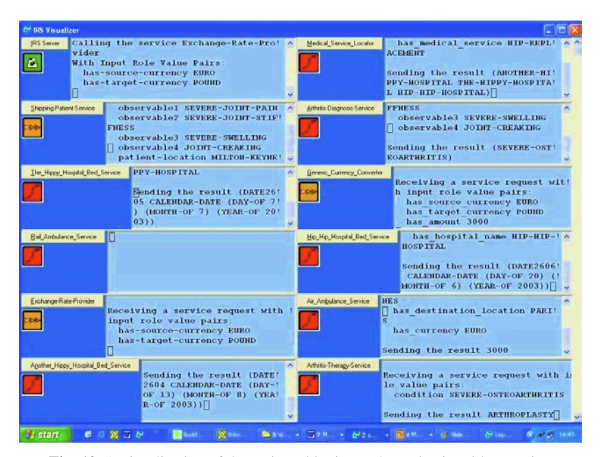
Fig. 10. A visualization of the patient shipping web service in mid execution