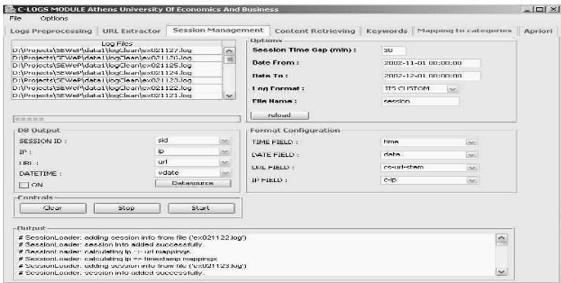
Fig. 2. SEWeP screenshot: Session Management module.