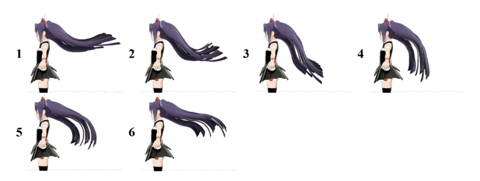
Fig. 2. Example of one cycle of hair motion with s = 1.2, k = 1.0, a = 0.8, and T = 0.45. The model "Tune-chan" was provided by G-Tune (http://www.g-tune.jp/campaign/10th/mmd/).

engine. The average angular error of our method is 11.4° while that of the physics engine is 27.1°. These results indicate that our method provides hair motion that is similar to that of hand-drawn animation and, as far as the above case is concerned, the motion is more accurate than that given by a physics engine in animation software.