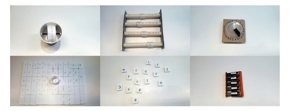
Fig. 1. The six co-designed conceptual prototypes used during the evaluation

Our research was structured into two main components: data gathering and evaluation. The data gathering consisted of demonstrative interviews from the target demographic and two group discussion sessions with a local branch of the Norwegian rheumatism association with 49 users. The collected data material included audio recordings of group discussions, field notes from observations, photographs, and transcripts from interviews. This data was used in a thematic analysis where we attempted to structure essential challenges. Based on the data gathering sessions, six conceptual prototypes were co-designed with the users to serve as thinking tools. These prototypes (depicted in Fig. 1) were designed to learn more about the capabilities of the users and help us reflect about the assumptions about the users and should therefore not be considered as end-results. The prototypes were used to carry out a task-based formative evaluation of performance and preference when interacting with alternative tangible text input interfaces. The evaluation sessions were carried out at the homes or care facilities of the participants. 15 people struggling with various forms of rheumatic challenges constituted the user group (average age of 71.4 years), while 11 health practitioners or HCI experts formed the expert group. The procedure for both the thematic analysis and the evaluation are further described in the next section.