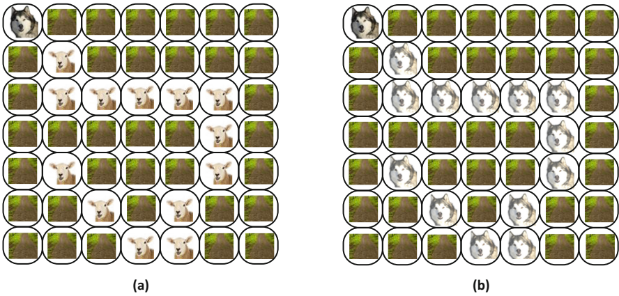
Fig. 3. An example of a wolf movement for the purpose of coding. The wolf starts searching from the upper-left portion of an image and then moves to the first location where he finds a sheep. Then, the wolf finds a sheep in a neighborhood location, thus moves to that location and so on. The relative movement of the wolf can be represented as: LM, SM, SM, SM, RM, SM, CRM, CLM, RM, CRM and SM