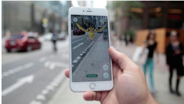
Fig. 1. Pokémon Go on iOS [5]

Go players in Germany. Three research questions arise: First, are privacy concerns a relevant issue for Pokémon Go players and do they differ in magnitude between different groups of players? Second, is there a relationship between the different dimensions of privacy concerns and the actual use behavior? Third, what are active players doing to protect their privacy on their smartphone?