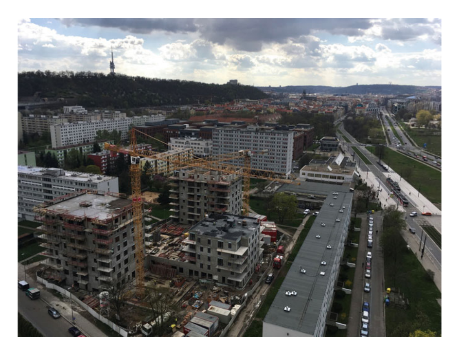
Fig. 15.4 Karlín Park, a new residential project on the site of a former kindergarten, is located in the core of the Invalidovna housing estate.

contains several suggestions of activities to improve the quality of life specifically aimed at housing estate neighbourhoods.