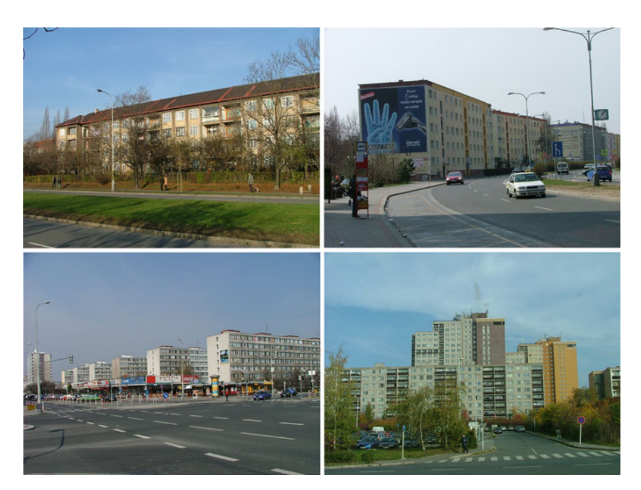
Fig. 15.2 Examples of housing estates in Prague: from top left, Solidarita (built during 1947–1949), Antala Staška (1954–1955), Pankrác (1964–1970) and South Town (1972–1992).