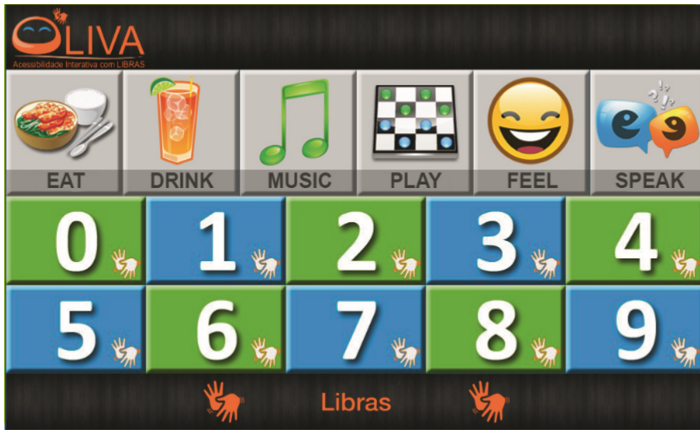
Fig. 1. Main screen

By accessing the specific functionalities of LIBRAS on the main screen the functionalities are presented, as in Fig. 2. The user can select what he would like to learn in sign language: the alphabet, the greetings, days of the week and months of the year, colors, numbers and other options that have not yet been developed but can be created.