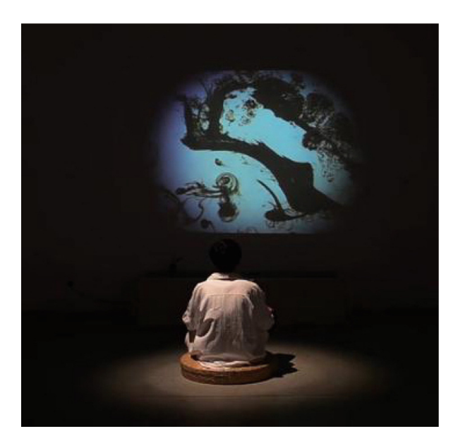
Fig. 1. (continued)