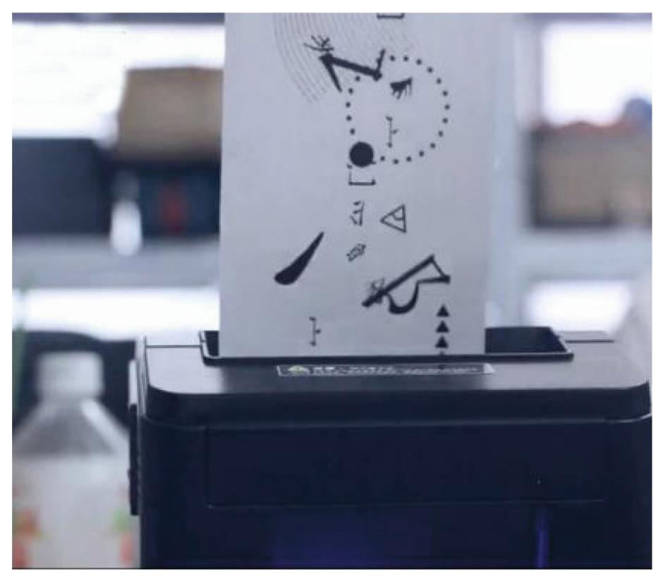
Fig. 2. Sound polaroid