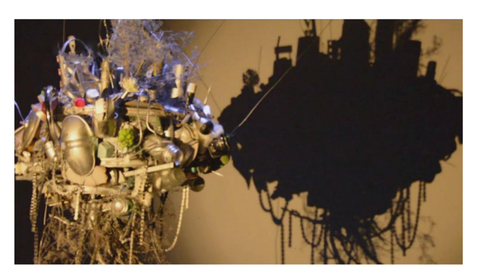
Fig. 3. The city in eyes