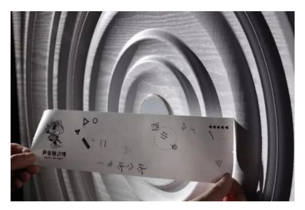
Fig. 2. (continued)

work breaks down people's perception of normal things and delivers them unexpected experience.