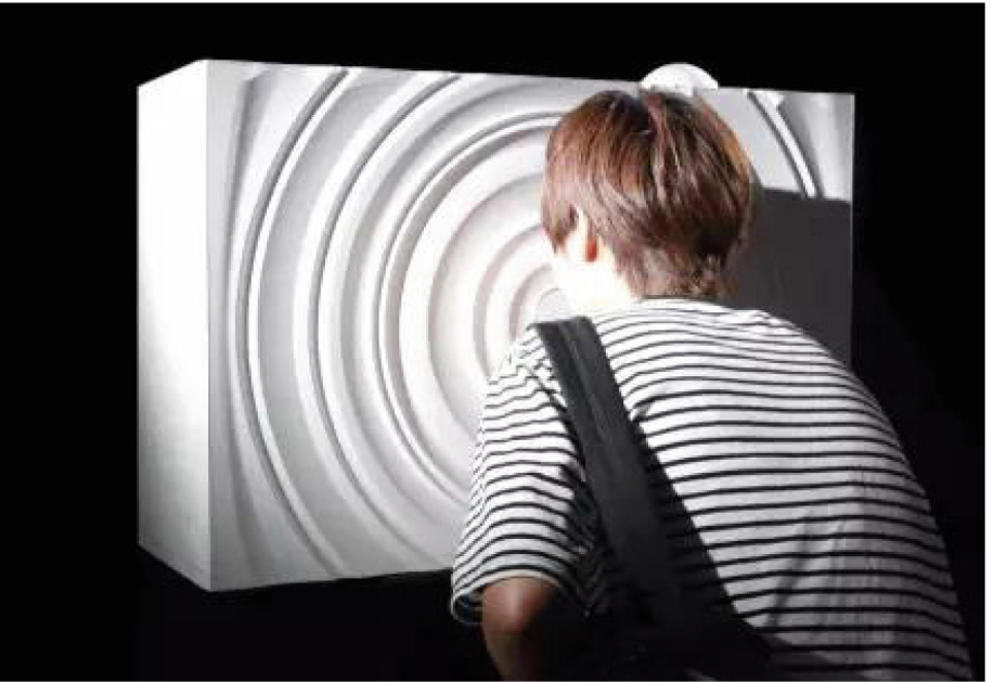
Fig. 2. (continued)