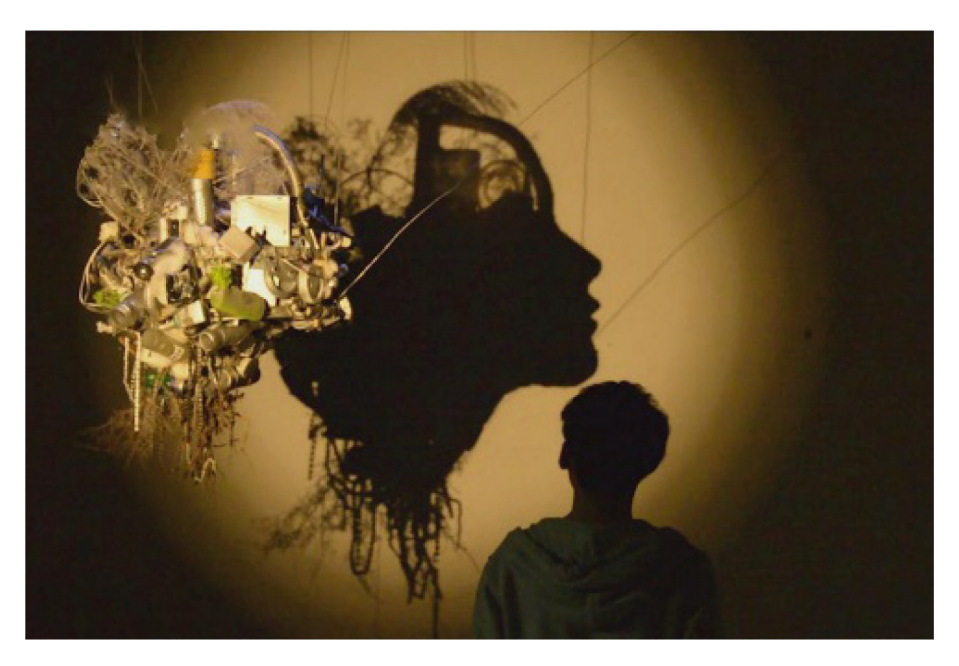
Fig. 3. (continued)

given rise to the thinking on various issues encountered by Chinese traditional customs in the course of globalization. Among the installations works created by students, the visual elements of Chinese, European, American, and African cultures are all fit into a