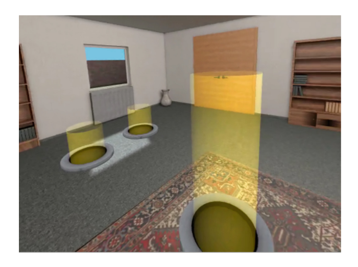
Fig. 1. View of the subject; 2 pillars are out of sight.

After the experiment, participants completed a post-questionnaire and a semi-structured guideline-based interview. The Simulator Sickness Questionnaire (SSQ) was completed at three times during the procedure: immediately before participants entered the VE (SSQpre), immediately after leaving the VE (SSQpost) and approximately 10 min later (SSQfinal).