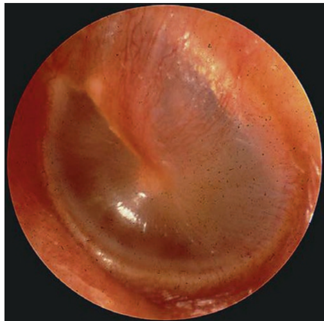
Fig. 4.1 Normal tympanic membrane.

The presenting symptoms of otitis externa include otalgia, decreased hearing, sensation of fullness in the ear canal, pruritus, tenderness on palpation, and movement of the EAC or the pinna. Otorrhea, adjacent cervical lymph node enlargement, and local cellulitis may develop later in the course of more severe cases. The most common bacterial causes of OE include Pseudomonas aeruginosa and Staphylococcus aureus [1]. Typical physical examination findings include erythema and edema of the EAC with debris, cerumen, and purulent material filling the canal. Visualization of the tympanic membrane (TM) is often obstructed by the otorrhea and the swelling associated with the inflammation. An unimpaired view of a normal TM, with visible landmarks, is shown in Fig. 4.1 . The diagnosis of OE is made based on the history and the clinical findings. Typical otoscopic findings of OE are shown in Fig. 4.2 . When the EAC is cultured, one must be cognizant that culture results may reflect EAC flora rather than a causative organism. First-line antibiotic treatments include topical otic drops of a fluoroquinolone, such as ciprofloxacin with or without topical glucocorticoid drops. If edema of the EAC is severe, placement of a wick inside the EAC may be necessary to ensure delivery of medication to the more proximal areas of infection. Risk of recurrence of OE is increased in individuals with atopic dermatitis, seborrhea, immune compromise, and repeated local trauma to the area when