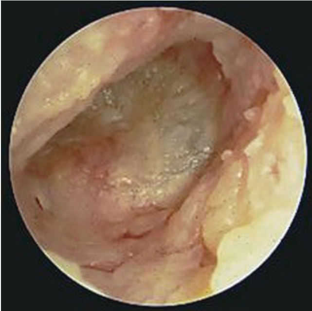
■ Fig. 4.2 Otitis externa.

cleaning the ear. A fungal etiology of the infection should be considered when otorrhea is prolonged, especially if topical antibacterials and a wick have been used already. Individuals who use hearing aids and those who have had recent bacterial infections are also at risk for fungal disease. The most common fungal etiologies include Aspergillus and Candida species [1].