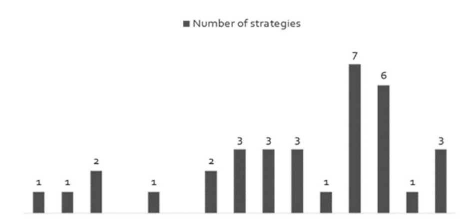
Fig. 2 Publication years of national internationalization strategies.

2002 2003 2004 2005 2006 2007 2008 2009 2010 2011 2012 2013 2014 2015 2016