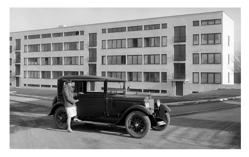
Fig. 14.1 Avant-garde housing by Ludwig Mies van der Rohe in the 1927 Weissenhof Siedlung in Stuttgart was used as an iconic background for the Mercedes-Benz limousine type 8/38 PS in 1931. The challenge of conceptualizing spatial opportunities for things to come seems more difficult a century later, with science and technology supersede human physical reality.