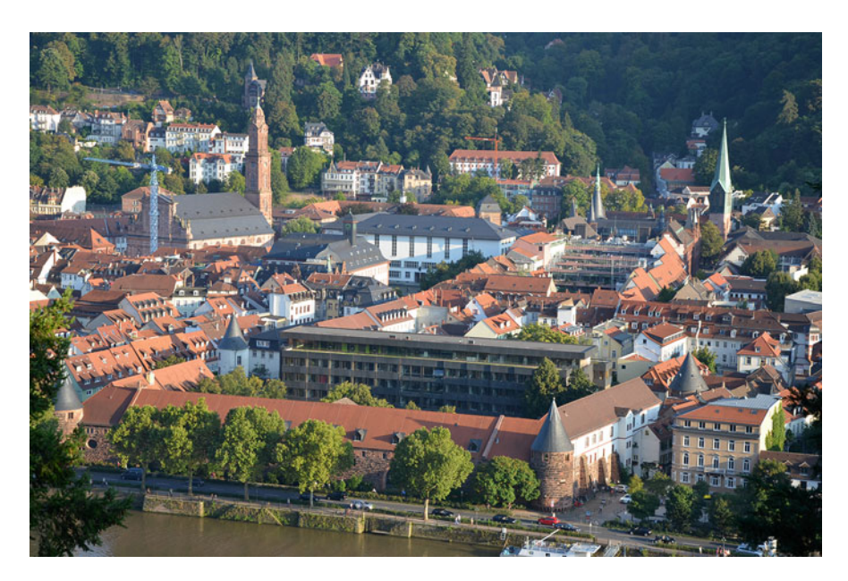
Fig. 14.2 Large administrative and faculty buildings of Heidelberg University, such as the Old University (1735), the New University (1931), and the Neues Kollegiengebäude (1965), alter the urban fabric of the Old Town. Debate continues about the direction in which the next leap forward is to go (e.g., the urbanization of monofunctional campuses?).