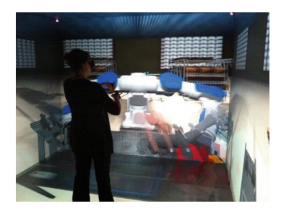
Fig. 6. Human Robot cooperation study. Virtual environment