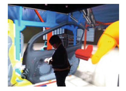
Fig. 4. Human Robot copresence study. Virtual environment.

In the case of HR Cooperation the worker and the robot are facing each other, and the robot can give various parts to the worker (see Figs. 5 and 6). Here the variables that were studied were environment type (Real/Virtual) and different levels of assistance of the robot. In the copresence scenario users preference (questionnaires) went to the 'far' condition, and this result was consistent between real and virtual environments. A increase in heart rate was found when the robot was close, in both real and virtual conditions. Finally, a skin conductance raise (that may be representative of user stress) when the robot was close, in the real conditions, was not found in the virtual condition. In the cooperation scenario, the main result is again that the questionnaires get close responses between real and virtual conditions (acceptability, perceived security, usability). And we observe the same trends on physiological measures as for the copresence use case. We can hypothesize that more complete feedbacks (such as haptics providing contact information with the environment, or auditory feedback for factory or simulated robot sounds) may increase ecological validity, but these require specific studies.