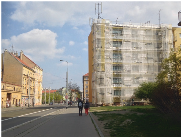
Fig. 2.2 Thermal energy retrofits can have a significant impact on the amelioration of energy poverty—as has been the case in inner-city Prague

In the mainstream literature on ‘fuel poverty’ in the Global North, the dynamics that underpin the condition are mainly identified within the narrow triad of low household incomes, high energy prices and inadequate levels of energy efficiency (Fig. 2.2). But these are only part of the factors that describe the likelihood of experiencing a socially and materially inadequate level of energy services in the home. The interplay between built