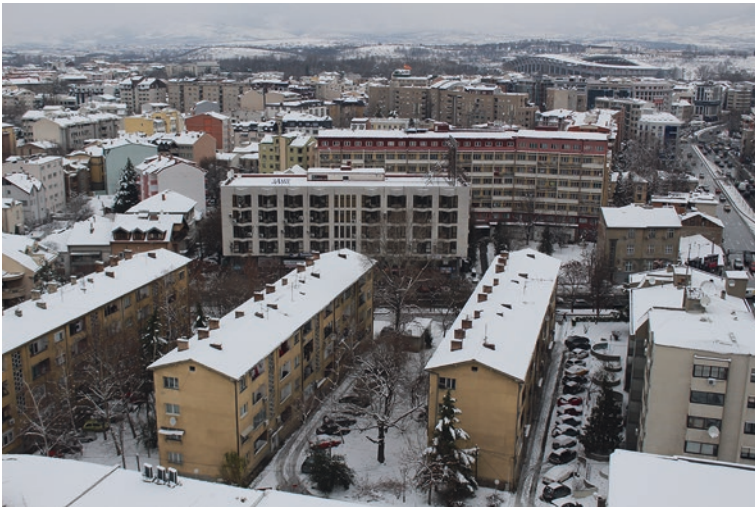
Fig. 2.3 District heating is common in the inner city of Skopje (Macedonia)—one of the case study areas of the Energy Vulnerability and Urban Transitions in Europe project

In situations where the structural fabric of the building, housing tenure and other legal obstacles do not allow for switching to a more suitable heating system, the household affected by the situation may find itself suffering from inadequate energy services even if it is otherwise able to afford the energy that it consumes, while living in a home that is well insulated (Buzar, 2005, 2007a) (see Fig. 2.3). Moreover, bringing needs into the equation leads, inter alia , to the conclusion that individuals who spend