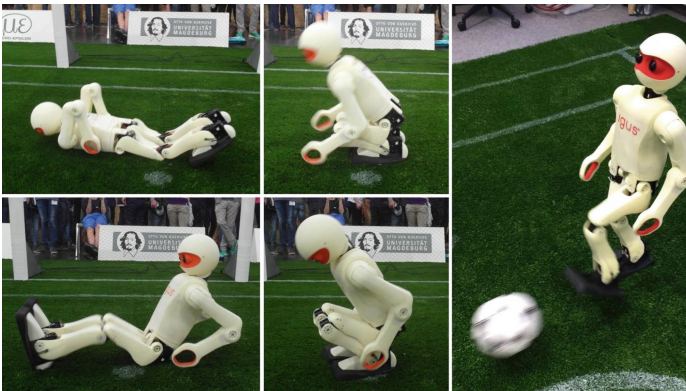
Fig. 3. Dynamic get-up motions, from the prone (top row) and supine (bottom row) lying positions, and a still image of the dynamic kick motion.

Often there is a need for a robot to play a particular pre-designed motion. This is the task of the motion player, which implements a nonlinear keyframe