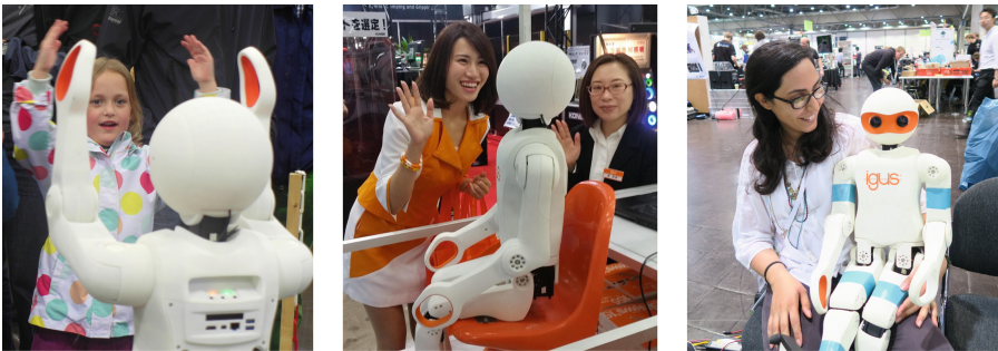
Fig. 4. Example human interactions with the igus ® Humanoid Open Platform, including waving to children (left), and face tracking (middle).

To date we have built seven igus ® Humanoid Open Platforms, and have demonstrated them at the RoboCup and various industrial trade fairs. Amongst others, this includes demonstrations at Hannover Messe in Germany, and at the International Robot Exhibition in Tokyo, where the robots had the opportunity to show their interactive side (see Fig. 4). Demonstrations ranged from expressive and engaging looking, waving and idling motions, to visitor face tracking and hand shaking. The robots have been observed to spark interest and produce emotional responses in the audience.