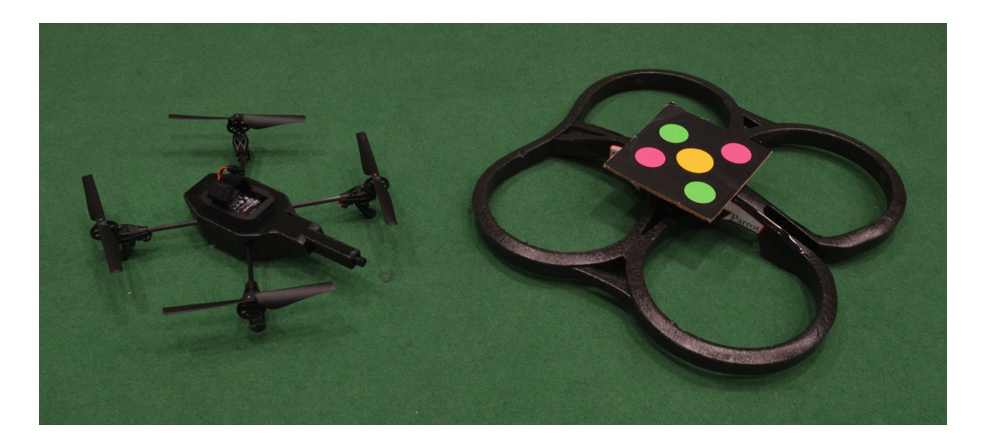
Fig. 1. The quadrotor we used to demonstrate our visualization, alongside its protective hull, which is used for safety when flying indoors. The colored pattern on top is not normally part of the hull; we used it for tracking (see Sect. 5). (Color figure online)