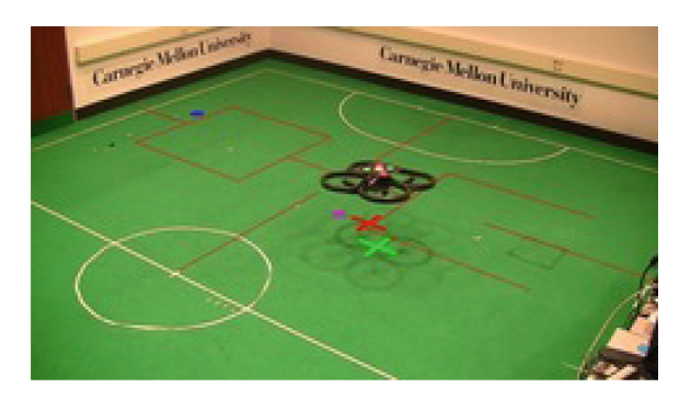
Fig. 6. The visualization generated when the quadrotor has executed an impossible move across an obstacle. The target point is the circle in the top corner, but navigation cannot continue until the quadrotor returns a point reachable from the red cross. (Color figure online)

Since the obstacles in the state space are virtual, it may happen that the quadrotor moves across an obstacle, between states that are not supposed to actually be connected. When this happens, the planner ceases normal path planning and moves the quadrotor back to the point where the boundary was crossed, to simulate being unable to move through the obstacle. In this case, the last valid point is shown with a red cross, as in Fig. 6.