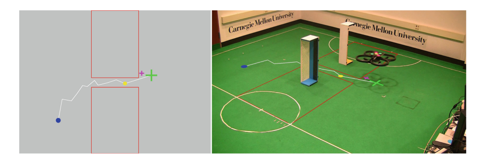
Fig. 3. Left: A 2-D visualization generated from the interesting events of one run of the RRT, using a domain based on physical obstacles. Right: The result of drawing that visualization onto the corresponding frame from the video of the real robot.

polygons) as primitives. Figure 3 shows an example of an frame from the output video, along with the image created by drawing the same primitives directly in a 2-D image coordinate system, and Fig. 4 demonstrates the stages involved in drawing each frame.