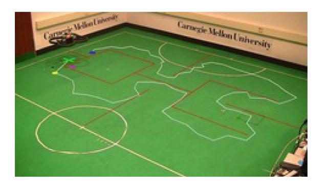
Fig. 5. The visualization generated from the RRT running with a domain consisting of entirely virtual obstacles.