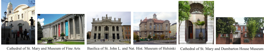
Fig. 3. Results of Listing 6 query

offers. The dataset also opens up a number of other use-cases. For example, one could consider combining the semantic information from DBPEDIA and the visual similarity information of IMGPEIDIA to create a labeled dataset along the lines of IMAGENET 8 , but with variable levels of granularity (e.g., Catholic cathedral, cathedral, religious building, etc.). Another use-case would be to develop a clustering technique for images based both on visual similarity and semantic context. We also believe that IMGPEIDIA can compliment existing research works in the intersection of the Semantic Web and Multimedia, where it could provide a test-bed for works on media fragments [4,8], or on combining SPARQL with multimedia retrieval [5], etc.