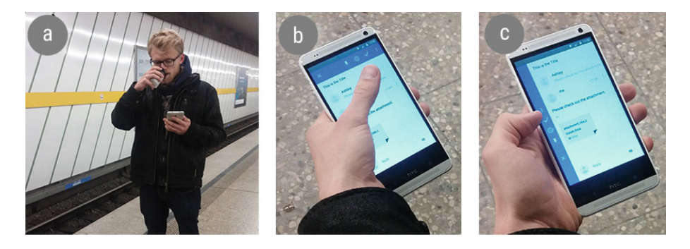
Fig. 1. In everyday life, (a) we often operate mobile devices with one hand. (b) On large devices, some screen regions cannot be reached comfortably. Here, the user struggles to touch the blue action bar at the top. (c) Rotating the bar to the left screen side renders it easily accessible. This may be triggered, for example, by "flicking", i.e. tilting the device to the left.

To address these challenges and improve one-handed use, we investigate dynamic adaptations of common GUI elements (Fig. 1). We contribute: (1) four dynamic UI adaptations for three common main elements in mobile touch GUIs, (2) evaluated in a user study with 35 participants in the lab, (3) resulting in insights into one-handed use and relevant design implications for large mobile touchscreen devices.