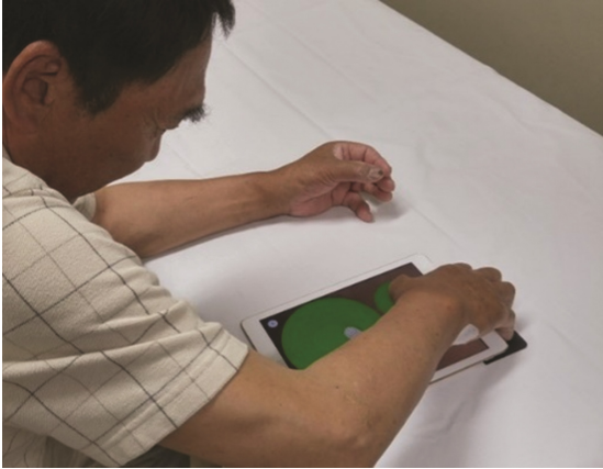
Fig. 2. Actual patient using app