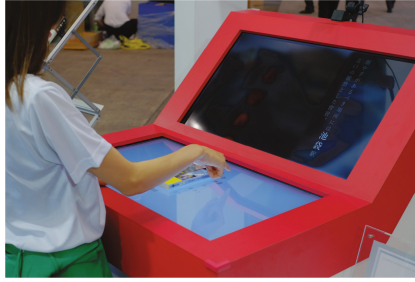
Fig. 1. A user using Zapzap.