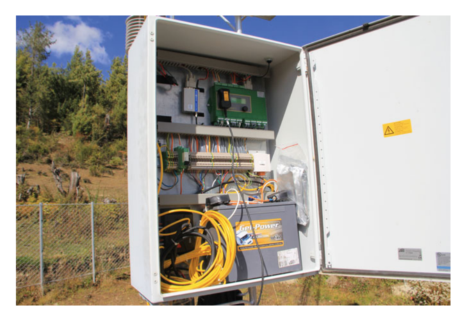
Fig. 2.3 Rara Nepal. OTT data logger and data transmission modem in IP65 enclosure