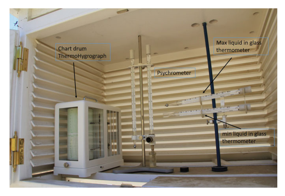
Fig. 2.2 Rara Nepal-Manual station in Stevenson Screen