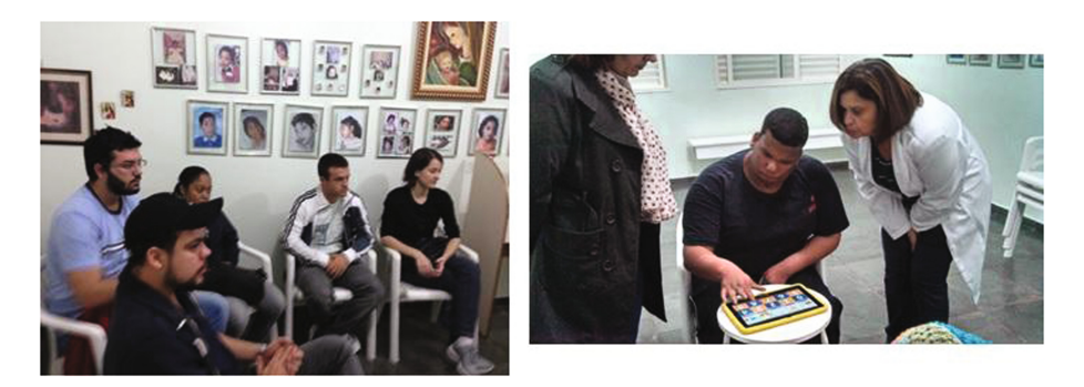
Fig. 2. Meetings at the healthcare professionals' workplace

presentation of initial prototypes and incremental refinements; (d) encounter for presentation of final prototypes and interview with users. After the interviews, users chose a prototype to be developed (Fig. 3).