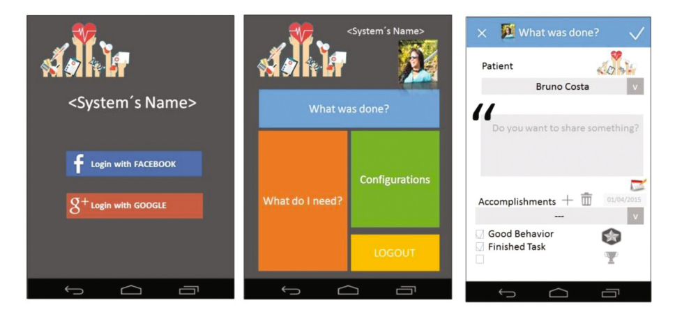
Fig. 3. Final prototype chosen by the healthcare professionals

We monitored the study and observed the employment of the guidelines in order to understand how the designers used them effectively. Such monitoring and the conducted interviews with the designers who took part in the study made possible mapping each one of the guidelines for the stages and activities of the model.