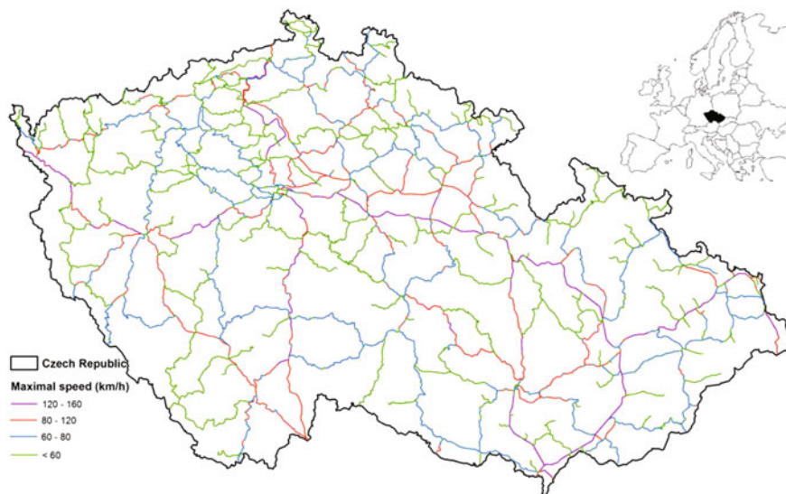
Fig. 15.2 Categorization of railways in the Czech Republic (location in Europe in inset ) by maximal speed

amount of transported goods, 91.6 million tons of goods were transported by railway with an average transport distance of 159.2 km in 2014 (CSO 2015).