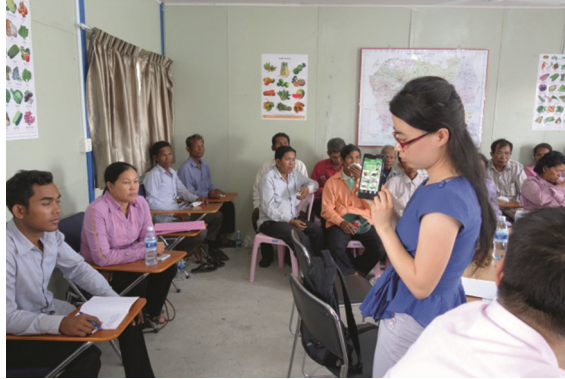
Fig. 2. Field demonstration

online inquires via mobile Internet (see Fig. 2). Farmers were fascinated by the demonstration although most of them may not be able to benefit from this type of dissemination model directly in the near future due to their low level education and computer literacy.