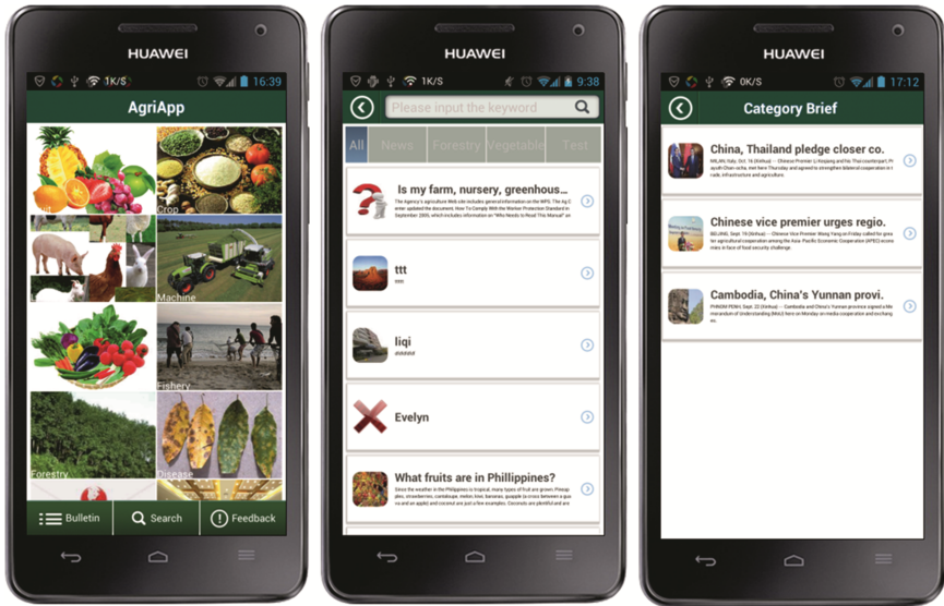
Fig. 3. Sample screenshots of AgriApp

display management. While the agricultural information service application provides farmers with three main functions, like agricultural information display, query/question consultation, etc. This type of information platform enables two-way communications of agricultural information between farmers and the information systems including expert team in the background, which forms an effective mechanism among information sharing and dissemination, and achieves sustainable development of the platform.