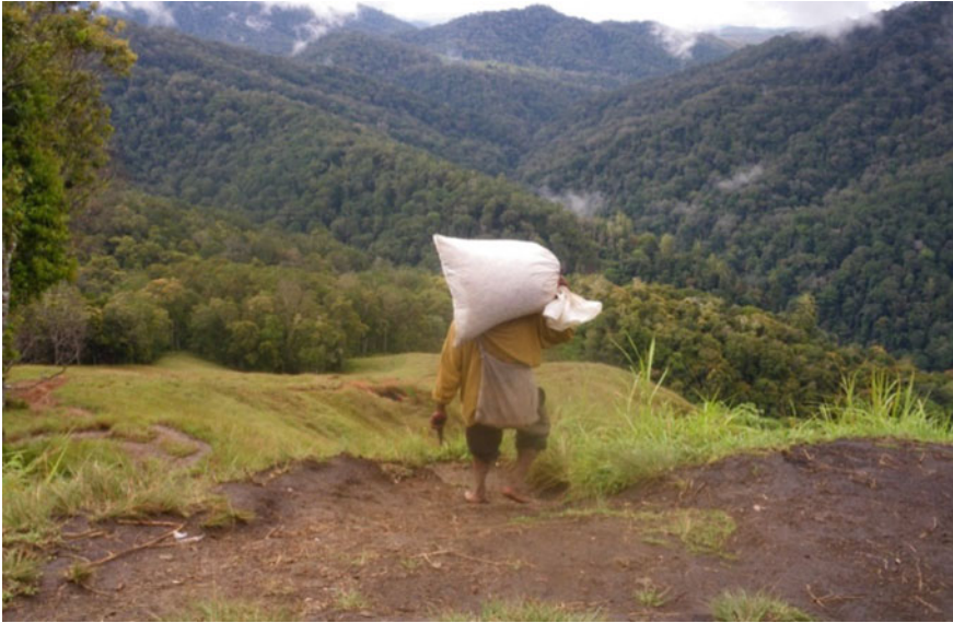
Plate 1 Coffee often has to be carried long distances to market in the PNG highlands

those isolated by rugged terrain (Plate 1) is very difficult and costly to the point that livelihood options are severely curtailed. Often migration to urban and rural resource development sites is the only viable option for people from these communities. Indeed, migrants from remote, poorly serviced and disadvantaged rural areas and small islands constitute a high proportion of the growing urban population (Koczberski et al. 2001; Storey 2010; Curry et al. 2012; Numbasa and Koczberski 2012).