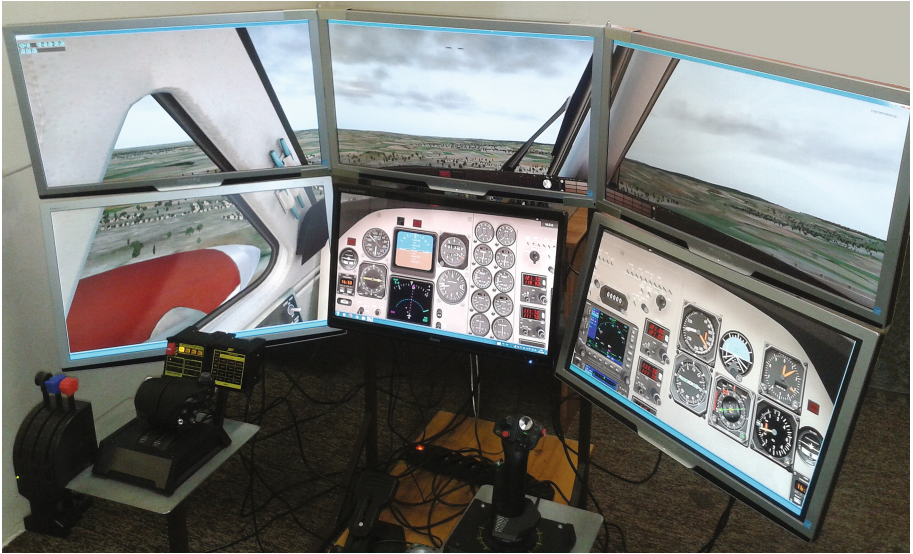
Fig. 1. The simulator at the Department of Air Electrical Systems, University of Defence, built on the basis of X-Plane 10 simulation program.