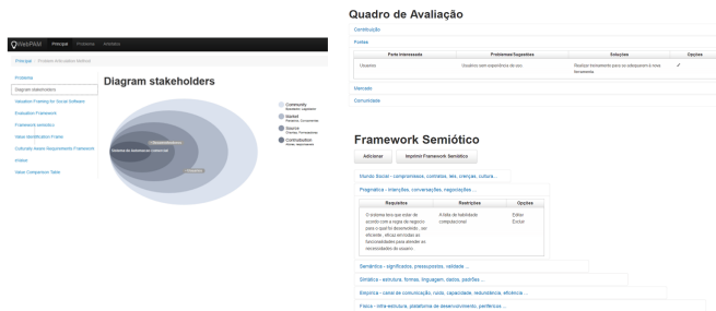
Fig. 2. The CASE tool's first version named WebPAM.

Evaluation: The tool's first version, see Fig. 2, was evaluated by 24 Information Technology undergraduate students of the University Center of Maringá 3 in Brazil (UNICESUMAR). The evaluation was conducted using the System Usability Scale (SUS) [6]. The students discussed a hypothetical problem by means of the CASE tool, and then evaluated it by answering a SUS questionnaire.