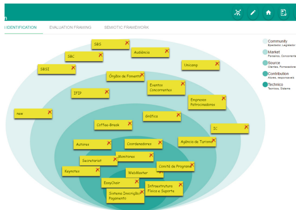
Fig. 4. SID for ICISO'16

Following, the participants used the EF to discuss how the conference might influence/affect or be influenced/affected by the different stakeholders identified