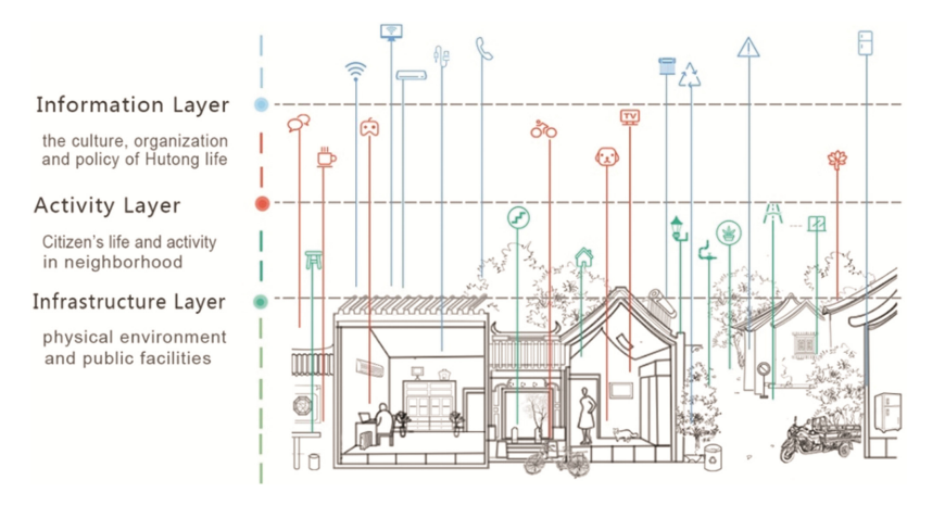
Fig. 2. Multi-dimensional community research model