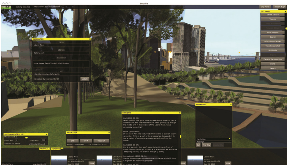
Fig. 2. The Betaville “Citizen’s Eye” view of the same scene as Fig. 1

Visual data/model integration – Qualitative data: Betaville’s qualitative value lies primarily in its ability to represent simplified models of proposed projects in a recognizable context, either through augmented reality or an immersive 3D model in a desktop “game” application, linked to metadata and external web resources (Fig. 2).