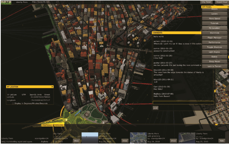
Fig. 1. The Betaville desktop client, “God’s Eye” view

Two current complementary technologies together embody many of the aforementioned performance specifications for our case studies, and can be further enhanced to meet transportation planning needs: the Betaville massively participatory online platform and the StoryFacets visual data exploration system. We believe that fast progress in urban system development can be made by using these tools as a starting point.