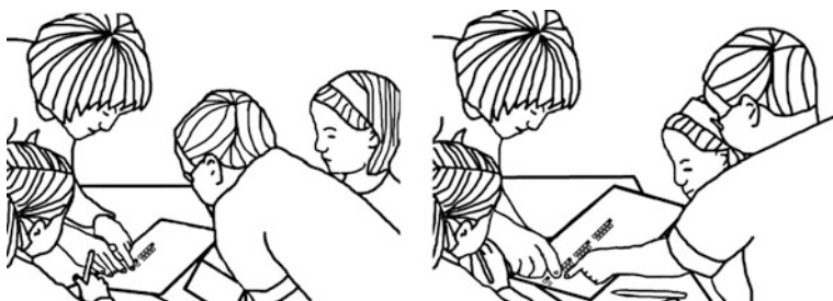
Fig. 2.3 Left The teacher pointing to the bottom rows . Right Students and the teacher counting together

The teacher says, “We will just look at the squares that are on the bottom.” At the same time, to visually emphasize the object of attention and intention, the teacher makes three consecutive sliding gestures, each one going from the bottom row of Term 1 to the bottom row of Term 4. Figure 2.3, left, shows the beginning of the first sliding gesture. The teacher continues: “Only the ones on the bottom. Not the ones that are on the top. In Term 1 (she points with her two index fingers to the bottom row of Term 1; see Fig. 2.3, left). How many [squares] are there?” Pointing, one of the students answers “one.” The teacher and the students continue rhythmically exploring the bottom row of Terms 2, 3, and 4, and also, through gestures and words, the non-perceptually accessible Terms 5, 6, 7, and 8. Then, they turn to the top row.