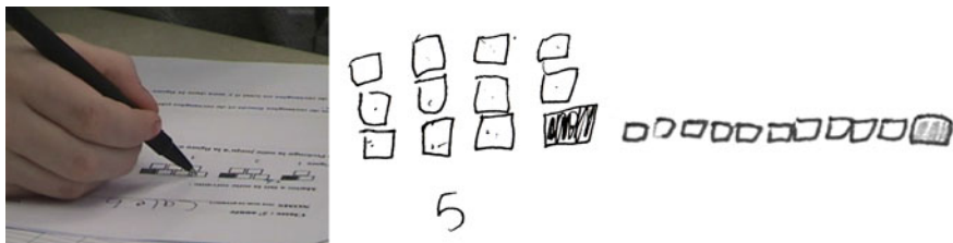
Fig. 2.2 Left Carlos, counting aloud, points sequentially to the squares in the top row of Term 3. Middle Carlos's drawing of Term 5. Right James's drawing of Term 5