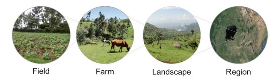
Fig. 9.1 Illustration of a nested hierarchy. Regions (East Africa) can be disaggregated to landscapes (natural forest, communal lands, and agriculture) to farms (mixed crop–livestock) to fields (cabbages)