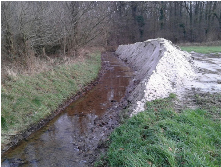
Fig. 9.2 Sand suppletion Snoeyinks brook

Several implementation projects were realized in the northeast of Twente: drainage systems were removed, ditches were muted (sometimes with sand nourishment, see Fig. 9.2), streams were shoaled and water storage areas were constructed. Drainage systems are typically geared towards getting rid of the water as soon as possible. Deep ditches and creeks have a similar effect of nearby land: they extract groundwater from the shores with also some effect on ground water levels further