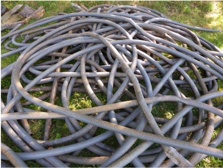
Fig. 9.4 Removed drain tubes

work on drought adaptation as well. One of the measures taken in consultation with farmers is to remove drainage systems that are in fact making the land vulnerable to droughts while lowering the water table too much (Fig. 9.4). The size of the “snowball effect” has surprised the practitioners. Several farmers have already volunteered to be included in a next round. Especially the smaller traditional farmers need to see results like better crop growth at the neighbour’s plot, to get interested.