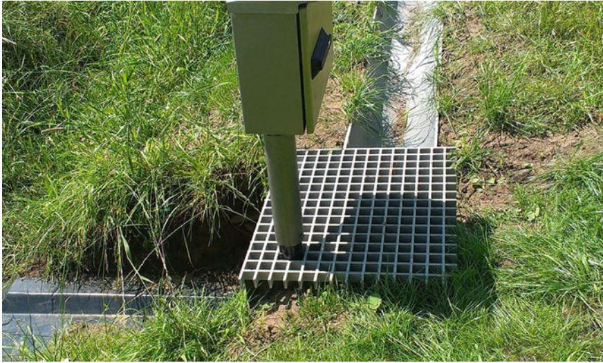
Fig. 9.3 Research equipment to study surface runoff

intensive agriculture, through which we aimed to better serve both nature and agriculture during long periods of drought. Vechtstromen water authority has constructed a system of level-dependent drainage in combination with raising the drainage basis of a small water-depleted nature conservation area to be able to test the effect on nature.