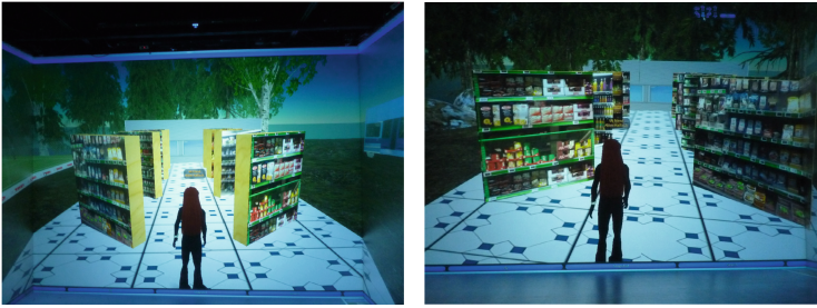
Fig. 2. Trials in SL: Plus perspective – A point (left) and Minus perspective – B point (right)